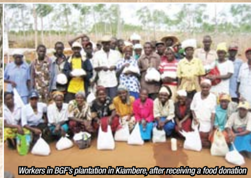
Workers in BGF's plantation in Kiambere, after receiving a food donation