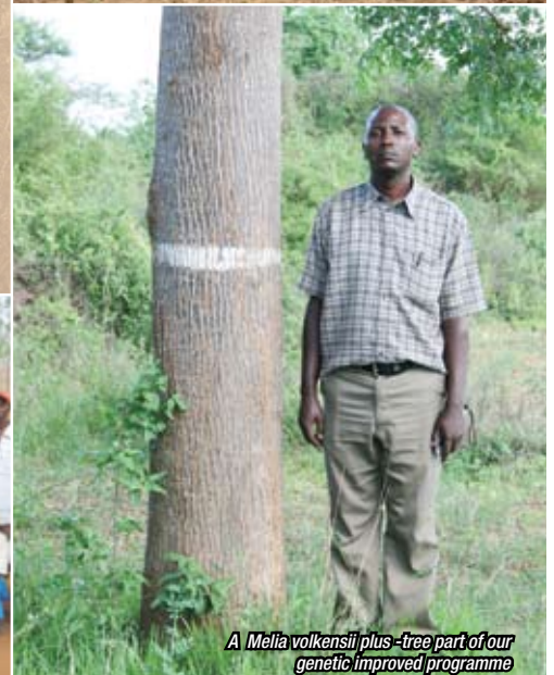
A Melia volkensii plus-tree part of our genetic improved programme