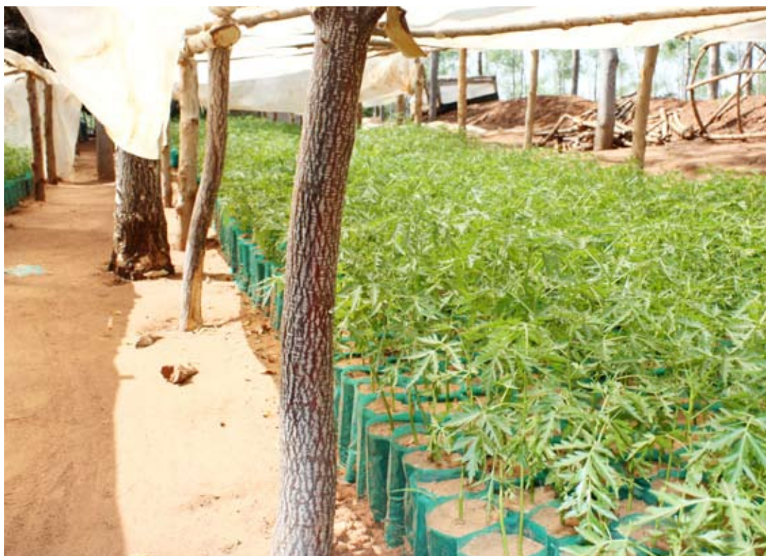
BGF's mukau ( Melia volkensii ) nursery in Kiambere - the biggest mukau nursery in the world! Hardening off of mukau seedlings.