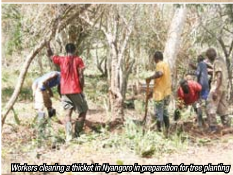
Workers clearing a thicket in Nyangoro in preparation for tree planting