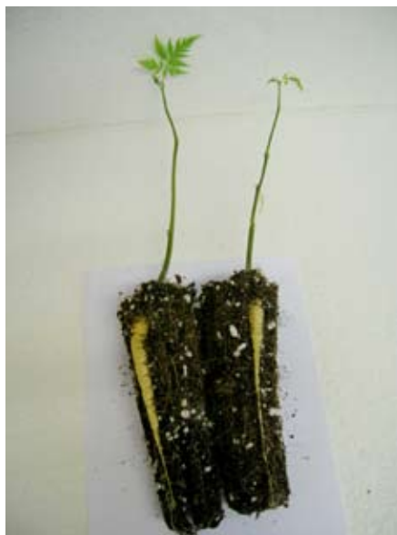
Two Melia volkensii seedlings produced "in vitro" showing good root development.

Maintenance consists mostly of weeding (keeping the competition out), pruning, thinning and firebreak management. The weeding as practised now is a combination of strip ploughing