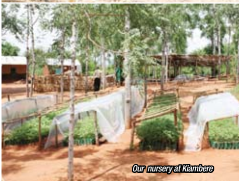
Our nursery at Kiambere