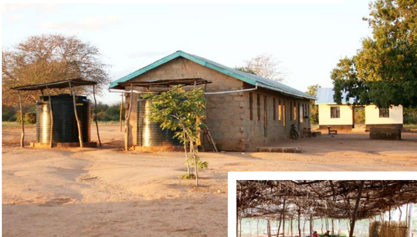
↑ Mboti Primary School in Nguni (Eastern Mwingi district). The roof catchments and water tanks were donated by Better Globe.