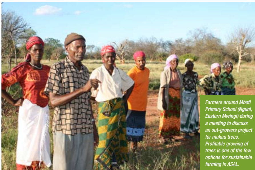
Farmers around Mboti Primary School (Nguni, Eastern Mwingi) during a meeting to discuss an out-growers project for mukau trees. Profitable growing of trees is one of the few options for sustainable farming in ASAL.