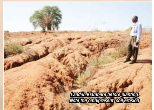
Land in Kiambere before planting. Note the omnipresent soil erosion