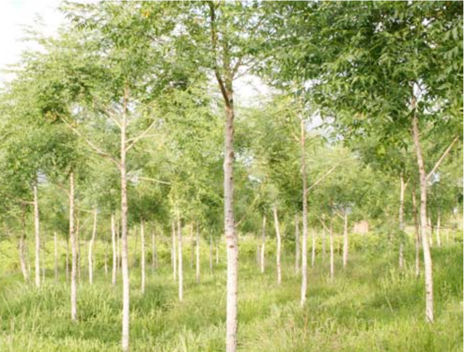
A two-and-a-half-year-old mukau plantation in Kiambere.