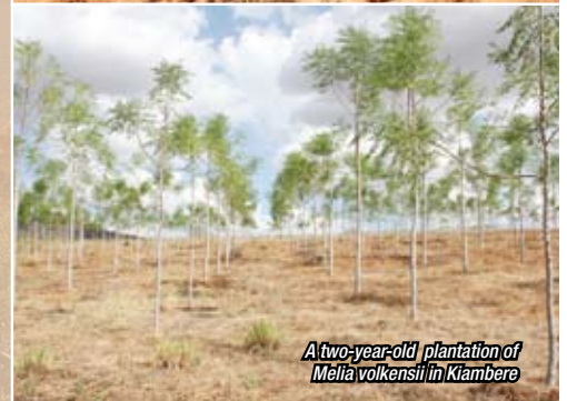
A two-year-old plantation of Melia volkensii in Kiambere