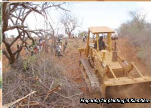
Preparing for planting in Kiambere